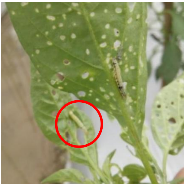
Figure 3. Spodoptera litura F.

This pest attacks curly red chili plants from the vegetative phase to the generative phase. The armyworm eats plant parts, namely the leaves. The symptoms of the attack are in the form of hollow leaves, but the epidermis layer remains. As a result of this armyworm pest attack, the photosynthesis process in plants will be disrupted so that the yield will be reduced in quality and quantity.