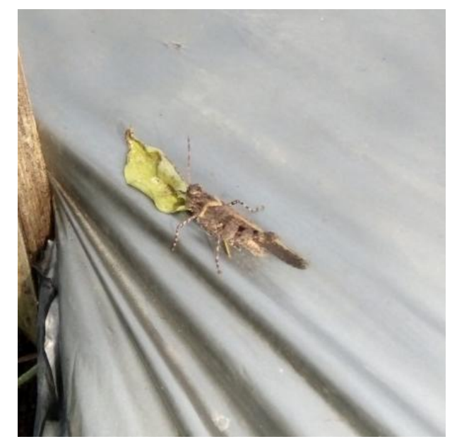
Figure 7. Valanga nigricornis