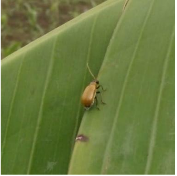
Figure 6. Aulocophora similis Oliver

Adult insects have a relatively small body, short, and fat. The back is brownish yellow and has a blackish mesothorax and metathorax. Overall, the adult insects appear to have a bright color and a plain glossy finish. The head does not extend into a snout. The tip of the abdomen is covered with elites and has short antennae, less than half the body length (Jana et al. , 2021). Oteng-oteng attacks plants from the larval stage, attacking plant roots until the plants wither and die. Adult oteng-oteng eats the leaves and leaves only the bones of the leaves.