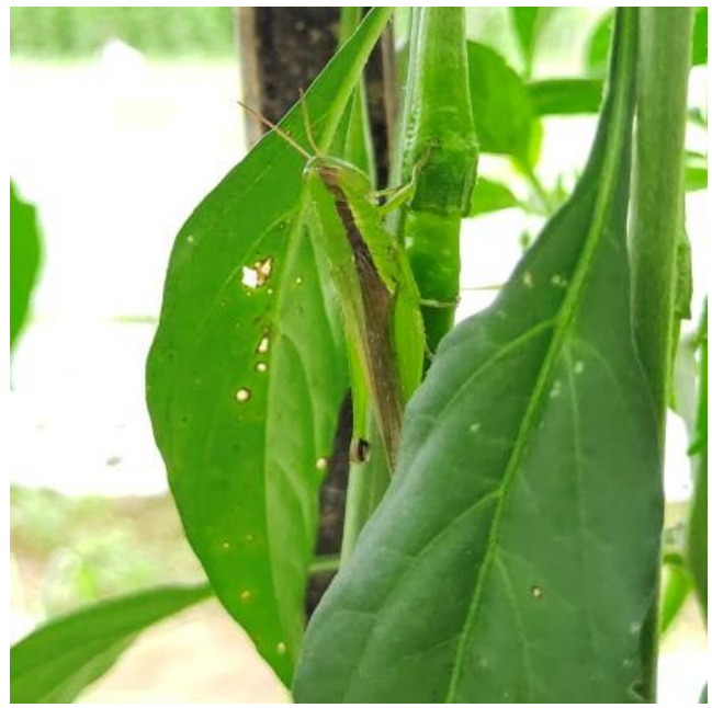
Figure 8. Oxya chinensis

The green grasshopper's body consists of 3 main parts: the head, thorax (thorax), and abdomen (abdomen), which has six jointed legs, two wings, and two antennae. The long hind legs are used for jumping, while the shorter forelegs are used for walking. Oxya chinensis , commonly called green grasshopper, has a dominant green color on its body and legs, brownish outer wings, and a yellowish belly. According to Borror (1992), grasshoppers have two pairs of wings: front and hind. The forewings are narrower than the rear wings, and the forewings have thickened or hardened veins. The hind wings are dilated with regular veins, and the hind wings fold under the forewings when resting. The green grasshopper has a slightly oval head with a pair of antennae on the head, and a couple of protruding eyes have a biting and chewing mouth type. It has six legs. The front four legs are smaller and shorter than the two hind legs. The front four legs are used for walking, and the two back legs, which are lengthier and more prominent, are used for high jumps. The green grasshopper is a herbivore that eats leaves.