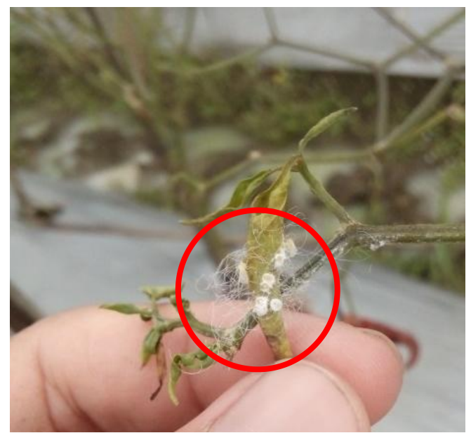
Figure 9. Bemisia tabaci Genn.

The development of B. tabaci consists of three stages, namely starting from egg, nymph, and imago. The eggs of B. tabaci are oval, clear white when just laid, then turn brown before hatching, placed on the underside of the leaves. The number of eggs produced by a female reaches 28 to 300, depending on the host plant and environmental temperature (Hirano et al. , 2002). This pest is found when the plant enters the vegetative and generative phases. Whitefly attacks can inhibit plant growth. Damage can be in the form of stunted plants and fallen leaves. This situation is due to leaf cell fluid that is sucked in by pests.