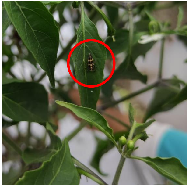
Figure 2. Trips (Thrips parvispinus Karny)

Trips are found in the flowers and leaves of plants. The role of trips as a plant pest is due to their eating activities. Symptoms of the damage caused are silvery brown spots on the leaves, which can interfere with photosynthesis, curling and curling of the leaves, and little terminal shoots (Kirk, 2002).