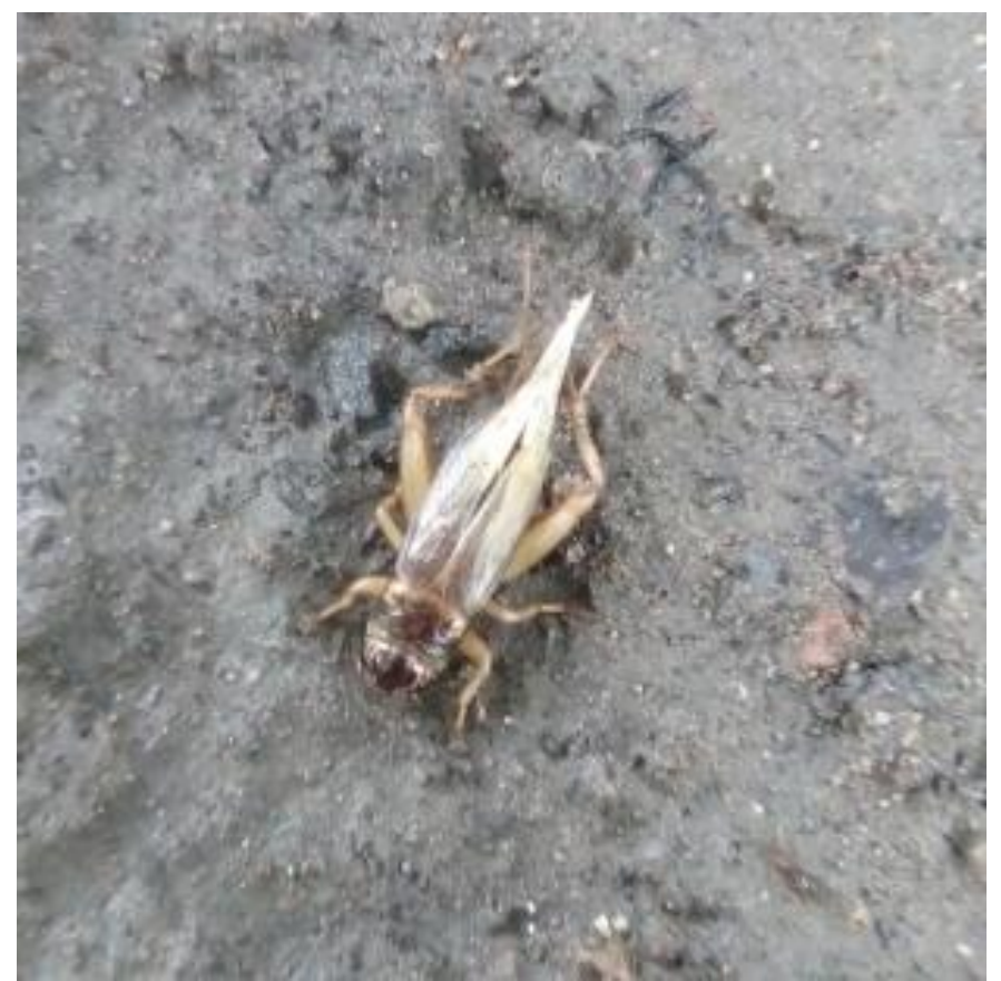
Figure 11. Gryllus bimaculatus

Crickets are insects of the order Orthoptera, with two pairs of straight wings. The forewings are closed, and the hind wings are thin and transparent. Type of mouth crickets bite and undergo incomplete metamorphosis. In the research area, cicadas were found in the adult phase. This pest will attack curly red chili plants during the vegetative phase. Crickets attack plants by biting young plant parts (seeds) so that the plant will die and need to be replanted. Crickets attack plants at night and in calm conditions and will hide around chili plants or under mulch.