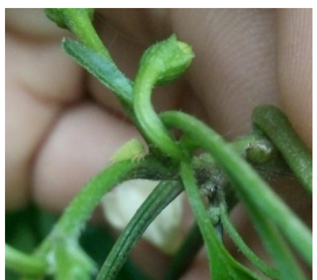
Figure 5. Myzus persicae Sulz

Aphids are classified as polyphagous pests, with their main hosts being vegetable crops, namely chili, potatoes, and tomatoes. Aphids can act as vectors for more than 90 disease viruses in about 30 plant families, including beans, sugar beets, sugar cane, cabbage, tomatoes, potatoes, oranges, and tobacco (Meilin, 2014). Aphids are found on plants from the vegetative