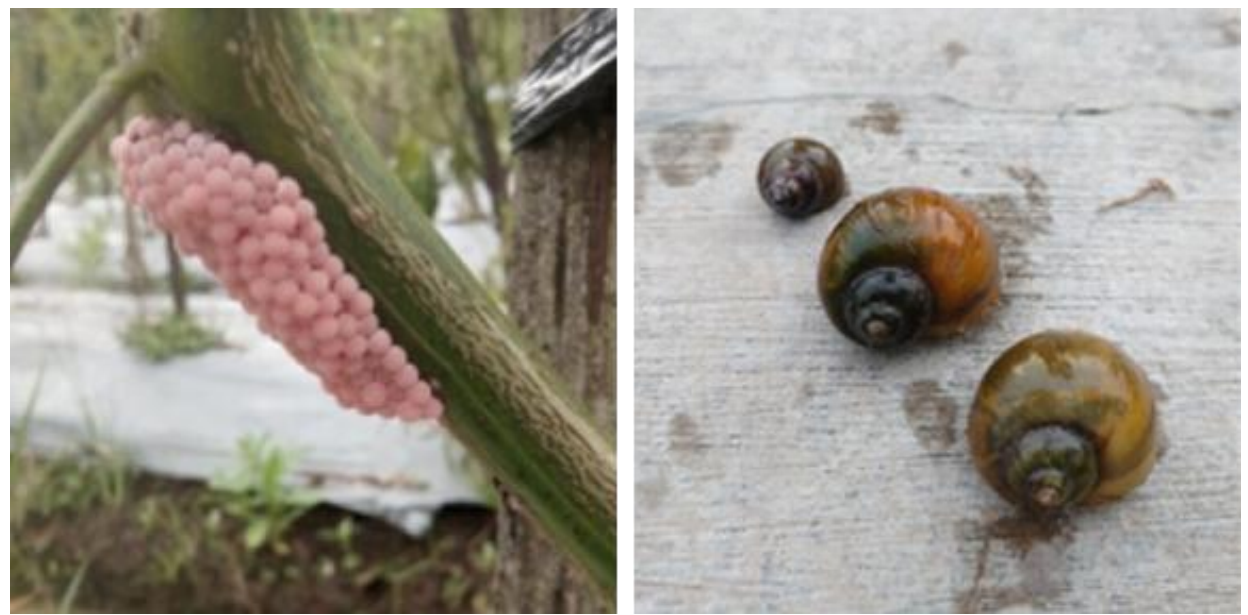
Figure 10. (A) Egg phase and (B) Growth