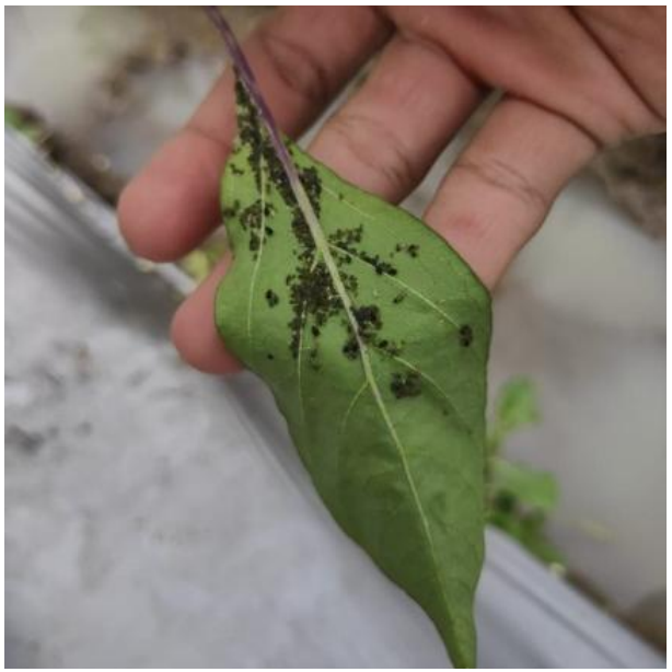
Figure 4. Tetranychus telarius L.

Based on observation, Imago mites ( Tetranychus telarius Linn) attack curly red chili plants from the vegetative phase to the generative phase. Symptoms of mite attack are gray-brown dots on the leaves or shoots of plants that are sucked in by plant cell fluids. Mites are small-sized pests (0.3 mm), red, green, or yellow. Mites like humid air conditions and hot air circulation (Hikma, 2018).