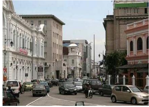
Figure 6 : European Architectural Style