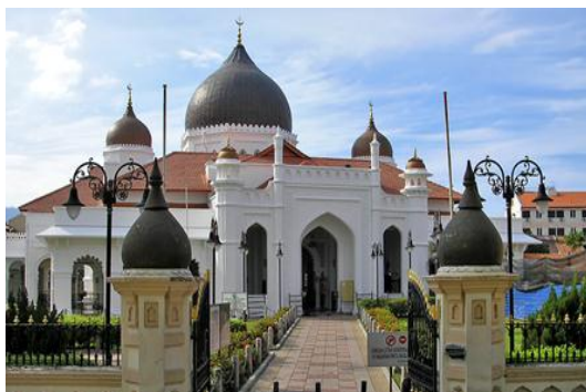
Figure 9 : Kapitan Keling Mosque

protected as a world heritage to maintain the historical value and authenticity contained in each building and its culture.