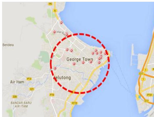
Figure 1 : George Town Location

George Town is the largest city with an area of approximately 250 hectares as well as the capital city of the island state of Penang, Malaysia. Taken from the name of one of the British Kings, namely George III (Cipuga, 2015, http://www.cibuka.com/2015/04/george-town-kota-bersejarah-yang.html ). George Town is located in the northern-most eastern part of Penang Island. The city has a population of 510,996 inhabitants.