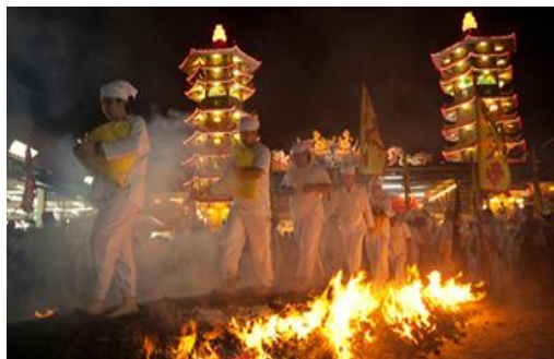
Figure 14 : Nine Emperor Gods Festival 2015, one of Cultural Event in George Town

Cultural festivals are expressions of views on cultural, social and political issues.