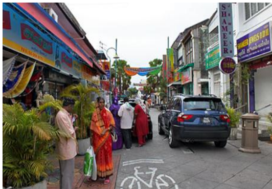
Figure 7 : Indian Ethnic Settlements