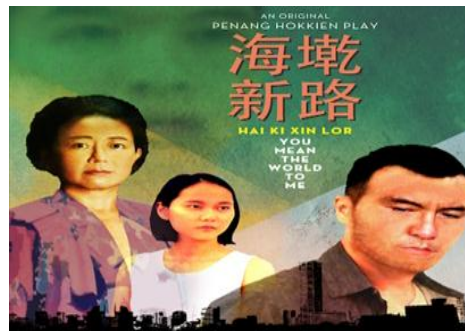
Figure 11 : Poster Hai Ki Xin Lor Movie, on George Town Movie Festival 2014

It is a celebration where the contents showcase a film production