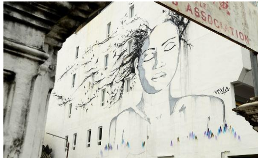
Figure 13 : Mural on Art Festival 2014 in George Town

competitions around the arts of music, theater, painting and crafts are held