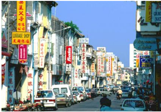
Figure 5 : Chinese Architectural Style