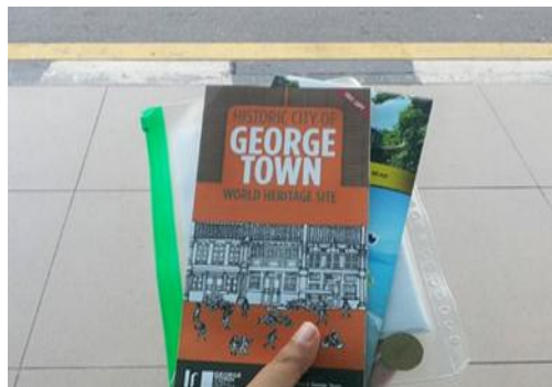
Figure 4 : George Town's Brochure as World Heritage Sites UNESCO

various relics of the British colonial era. According to the provisions of UNESCO's World Heritage Sites, the George Town area is divided into a buffer zone and a core heritage zone.