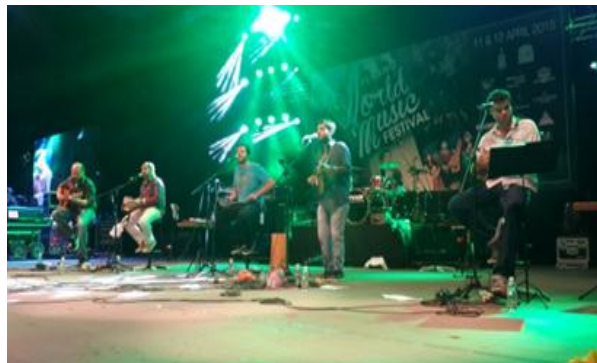
Figure 12 : Penang World Music Festival 2015 in George Town

music, modern music or promoting a composer's / outstanding work, can also take the form of a contest for a singer or composer.