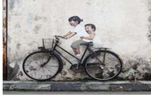
Figure 17 : One of Mural in George Town