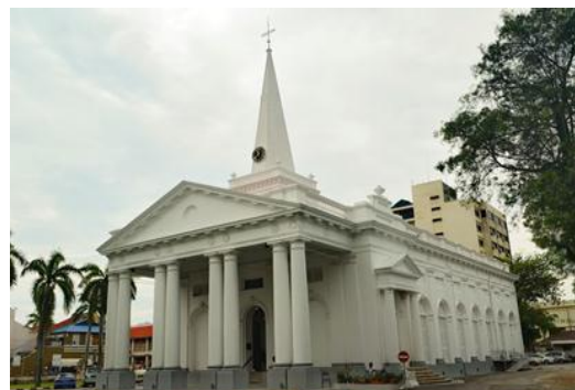
Figure 10 : St. George Church in George Town