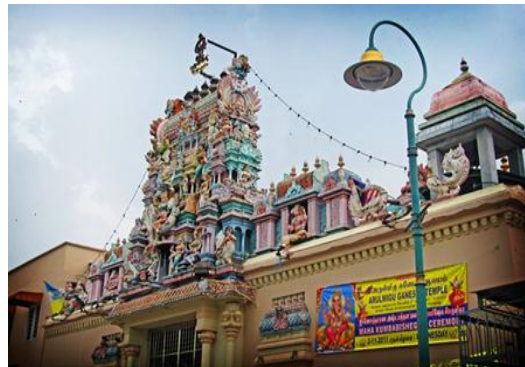
Figure 8 : Sri Mahamariamman, Indian Temple

Most of the buildings in George Town are an area that has not changed over time, with all its historical, cultural, and unique architectural heritage. Therefore, this city is