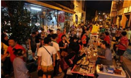
Figure 16 : Night Culinary Street Food

Public facilities that were previously provided to support urban tourism are now a special attraction for tourists. Examples are night culinary tours, mural exploration, and unique transportation such as umbrella bikes in George Town.