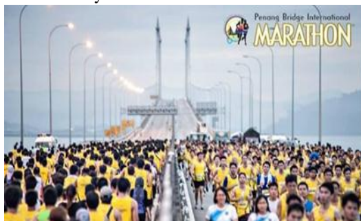
Figure 15 : Penang Bridge International Marathon in George Town

Cultural festivals are festivals with sports as the main activity.