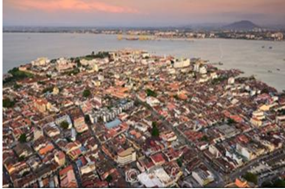
Figure 3 : George Town's View from above

in the trade route in the Malacca Strait, where Penang is a port city and the entrance to the Straits of Malacca for traders from the north