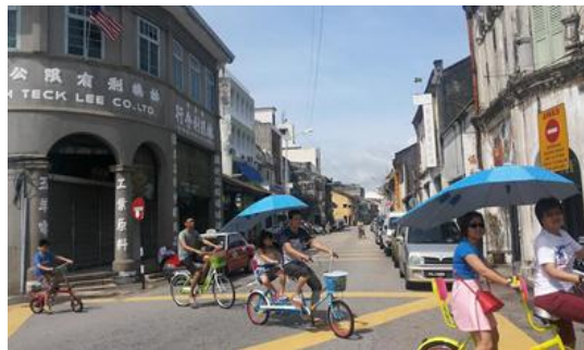
Figure 18 : One of Unique Transportation

Both events or special interest tourism in George Town are held for a certain period of time. With the existence of events and special interest tourism, tourism in George Town is increasing because these things always change according to community demand from time to time as the area in George Town becomes more and more alive.