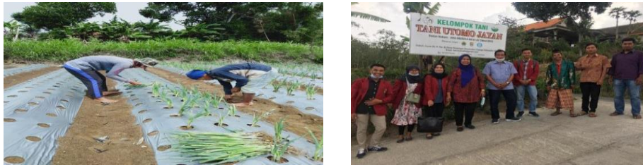
Figure.1 Analysis of the strengths and weaknesses of the farmer group

necessary to gain recognition beyond the Boyolali region, and collaboration agreements with partner companies for wider marketing should be established.