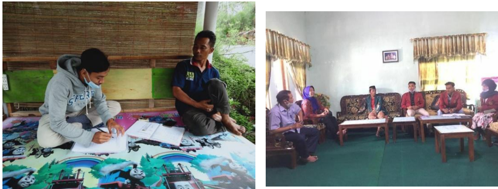
Figure.2 Analysis of marketing opportunities and threats

indicates that the farmer group's external position is below average, suggesting that their ability to respond to opportunities and threats is still not optimal.