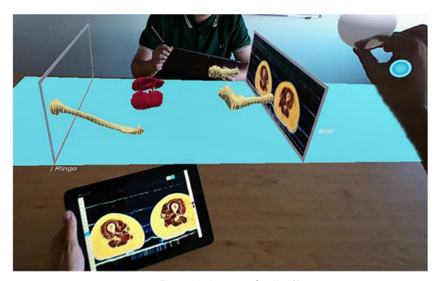
Figure 2. Anatomy Studio [1]